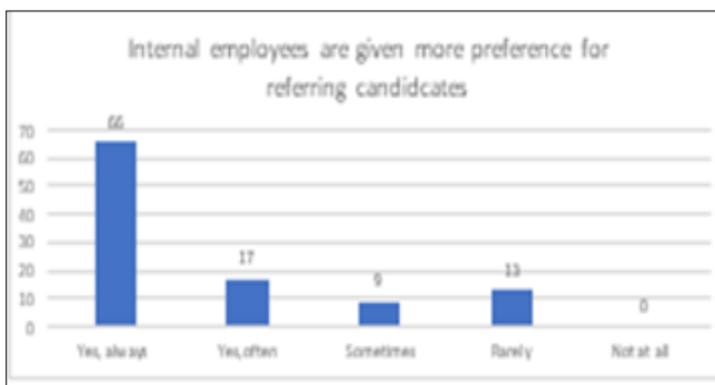
Fig 1: Internal Employees are given mre preference for referring candidates