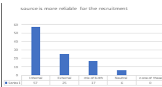
Fig 3: Source reliable for recruitment of the respondents